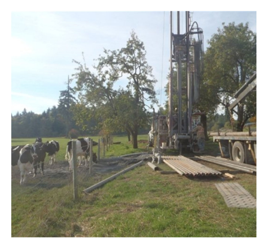
Plan for the future — get licensed now.