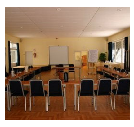
IIABC looking at alternative formats for courses.

register for a scheduled examination date by contacting the office. For registrants outside the lower mainland examinations may be proctored at a location on Vancouver Island or the BC Interior.